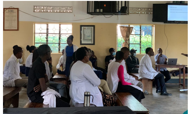
(Above) The UCI team provided education for the clinical team (Below left) An ECHO is carried out by a UHI team member (Below right) A large crowd gathered to receive free services

Kiwoko Hospital is glad to have worked with Uganda Heart Institute as we seek to improve cardiac care in the region.