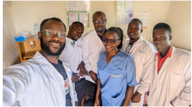
Some of the Kiwoko Hospital staff who helped out at the Easter Medical Camp