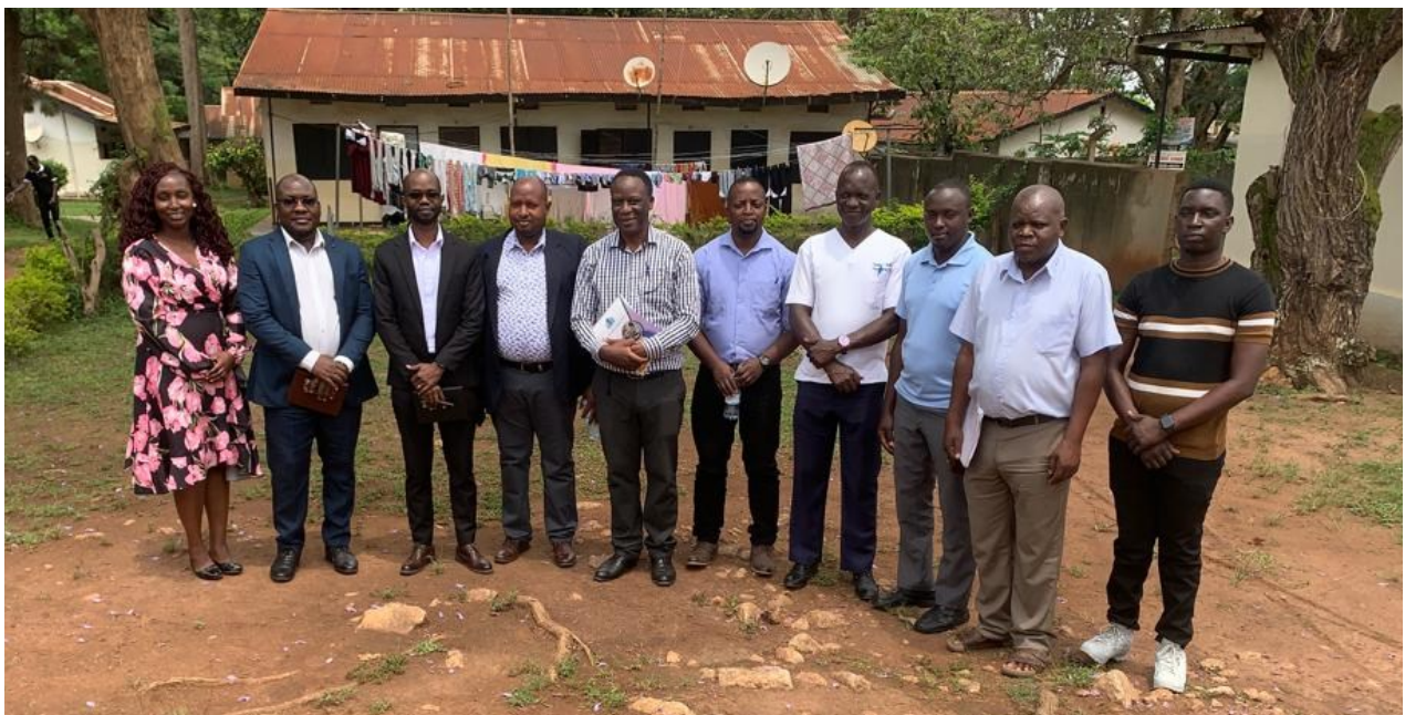
Hospital Management and members of the JMS team at the proposed site for the new Kiwoko Hospital Radiology Centre

businessmanager@kiwoko-hospital.com kiwoko-hospital.com