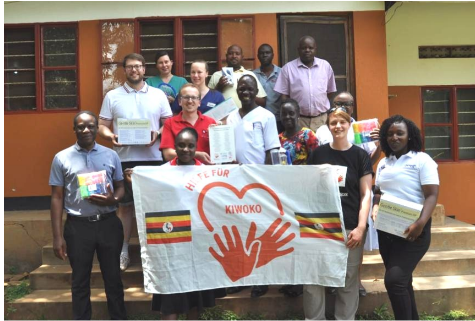
The Hilfe für Kiwoko visitors alongside some of the KH Management team

Since then, the association has achieved many milestones. Support for the hospital has included: theatre lights for the operating theatre rooms; a blood bank fridge, roller mixer, and HB Electrophoresis machine for the hospital laboratory; Ultrasound scan machine and refurbishment works at the Radiology Department; 220 solar panels that produce 75KV of energy for the hospital; a revolving fund for KHHTI students that helps finalists clear their school dues; the 4-bed High Dependence