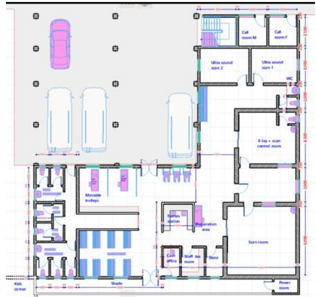
Plans for the new Radiology Centre

However, to be able to have the machine on ground, the hospital needs to have structural enhancements including upgrading the infrastructure of electricity and setting up a new structure that meets radiation requirements of the regulatory bodies. Architectural plans for a Radiology Centre have been developed. The hospital is also currently working with partners, experts and electrical engineers to assess the