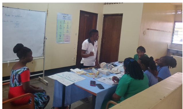
(Top) NICU trainers with the MOs who attended the training; (Below) Nurses at NICU teaching session

Centres in Mubende. The training was funded by Clinton Health Access