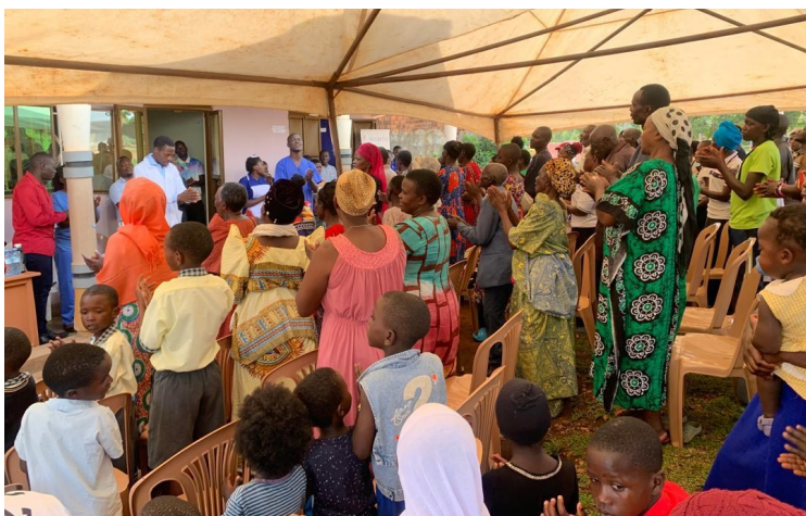
Part of the large crowd who gathered for the Easter Medical Camp and Crusade