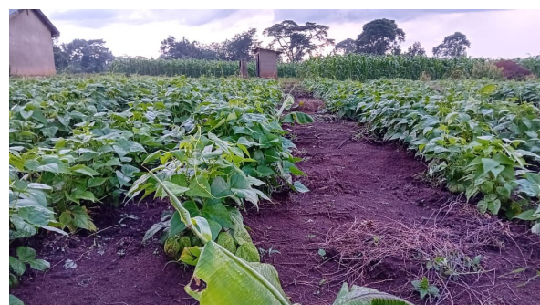
There is much growth on the land at Magoma