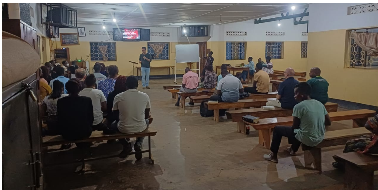
The Christianity Explored team provided teaching on how to communicate the Good News of the Gospel