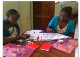
Kiwoko Fashion School, Day one.

prayerfully, financially, and generously with all our equipment from scissors to pins, sewing machines to sketch pads being donated from individuals and churches.