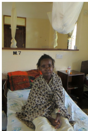
Female Ward patient after treatment

A woman from a local village came to Kiwoko Hospital complaining of progressive weakness in her legs impairing her ability to walk and incontinence for several months. She also complained of intermittent fevers and was HIV positive. An x-ray was taken and revealed a tuberculosis (TB) abscess that was