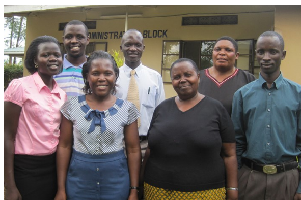
Teaching staff at Kiwoko Nursing School

Congratulations to all the nursing students. The nursing school had a 100% pass rate in the last final exams. 2 candidates gained distinctions and 30 gained credits. This is a remarkable achievement showing the hard work put in by teaching staff and students alike.