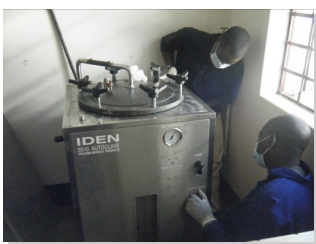
Engineers repairing the Autoclave

Despite having a phenomenal engineering team, we do still need to replace some very old equipment.