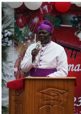
(Above) Special Guest, Caretaker Bishop of Luwero.