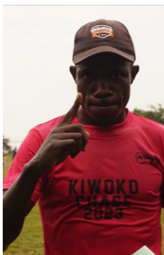
Kiwoko Chase 2023 Number 1 runner—15k later and still fresh!

"...a variety of activities, all with the intention of raising funds for HDU-like beds on male ward."