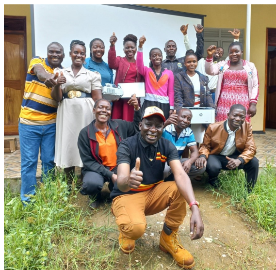
CBHC team receiving the donation from ECHO

Thank you to ECHO International Health Services for this wonderful donation.