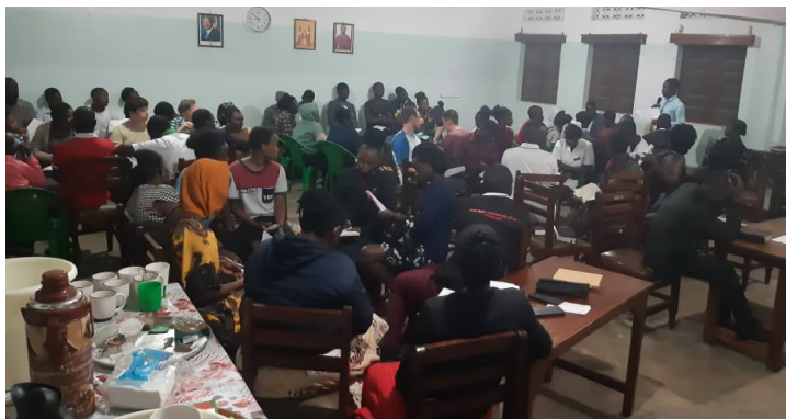
Witnessing at Work Seminar (above) and Compound Ministry (below)