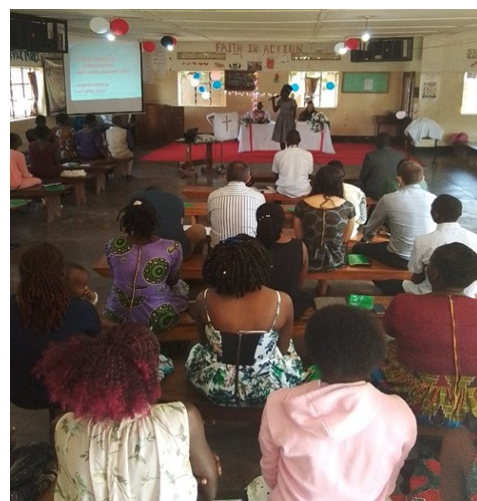
Part of St Luke's congregation (above), St Mary's Team visiting Kiwoko Hospital (below) and Games Day at Sunday School (bottom)

During the second half of the church service, the children move out to have their own time together. The numbers have grown, with between 30 and 50 children attending. Over recent months they have been taught about the Fruits of the Spirit, Miracles of Jesus and currently they have been studying the early chapters of Genesis (creation, the fall, God's plan of salvation etc). We thank God for this opportunity to teach the little ones, and are thankful to each of the leaders who have been teaching the children the Bible through songs, games and Bible stories.