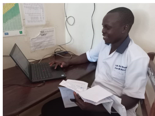
Using Streamline in OPD

Although we have been able to commence use of Streamline at OPD, due to a shortage in hardware (laptops, printers etc) we are currently functioning with a dual paper-computer system with the majority of clinics continuing to use the older paper system. A further 15 laptops/computers and 1 wireless printer are needed to support this ongoing implementation of Phase II and to allow full computerisation of the outpatient/clinic experience. In time, the ultimate aim is to progress to full computerisation of the hospital patient records, both at OPD and IPD which will require significantly more hardware given the size of the hospital.