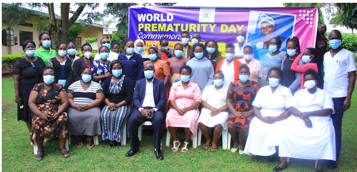
Group Photo to commemorate World Prematurity Day 2022