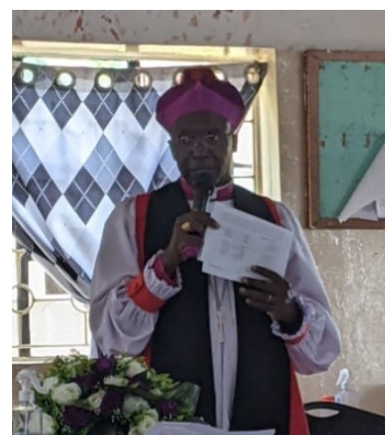
Bishop Eridard Nsubuga addresses the congregation