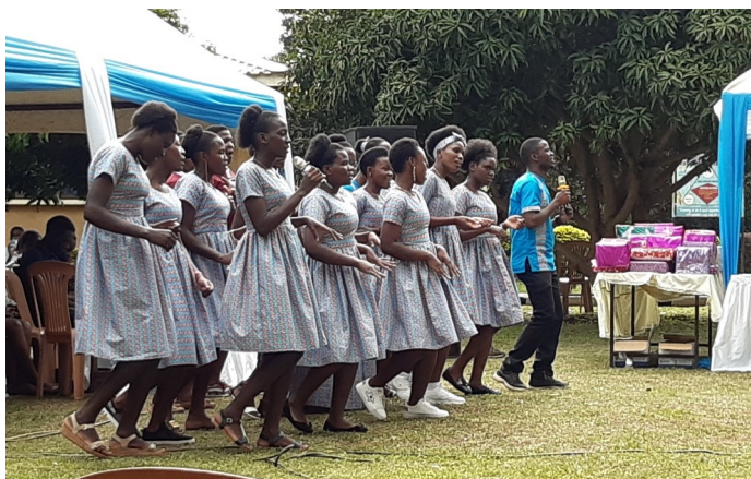
End of year Christmas Party!

activities through prayer, moral and financial support. My prayer is that God will bless you all with the